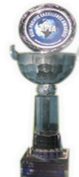
Asia Pacific Excellence Awards Outstanding Global Marketing Company