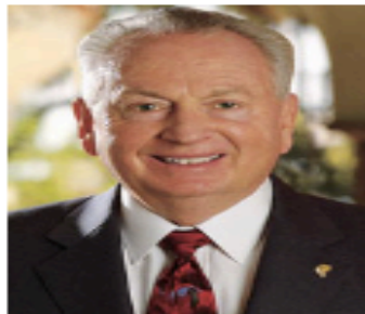
9. Forever Living Pr. - US