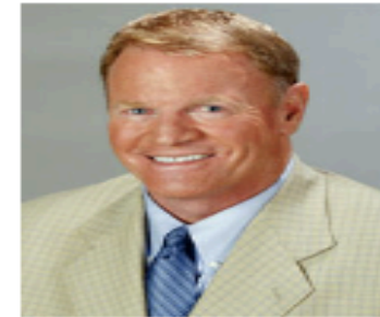
7. Nerium International - US