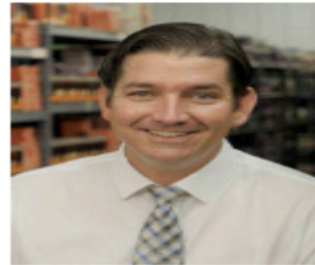
8. Jewelry in Candles - US