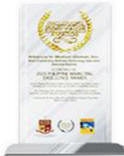
Philippine Marketing Excellence Award Most Outstanding Nutritional Technology Supplement