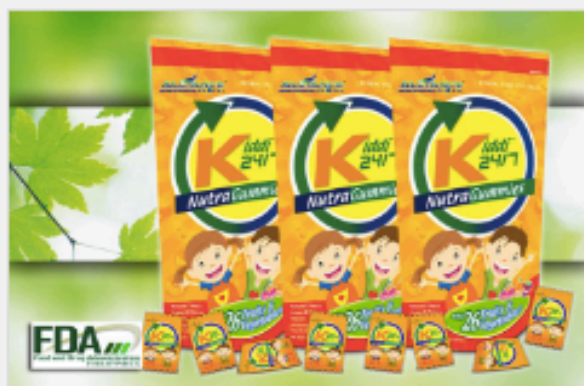
KIDDI 24/7 NUTRAGUMMIES