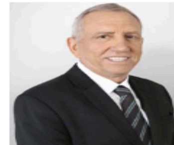
11. UP! ESSENCIA - BR