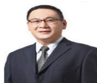
10. PhytoScience - MY