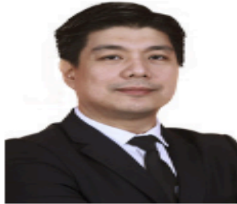
1. Alliance In Motion - PH

Alliance in Motion Global has been voted number one direct sales company in the world for 3 consecutive years