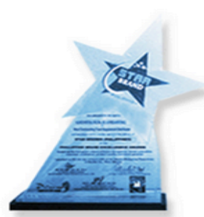
Asia Star Brand (Philippines) Most Outstanding Food Supplement