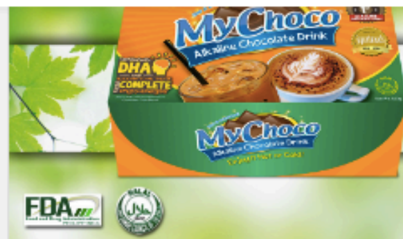
ALKALINE CHOCOLATE DRINK