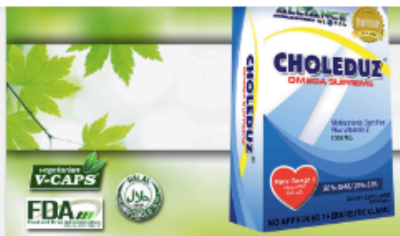
CHOLEDUZ OMEGA SUPREME