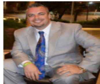
12. Total Life Changes - US