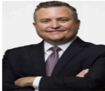
5. LifeVantage - US