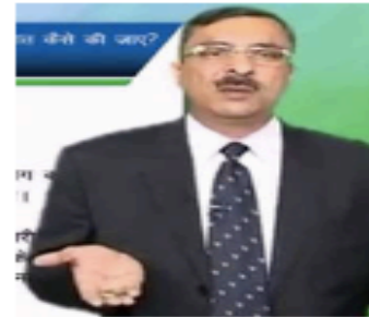
6. Vestige Marketing - IN