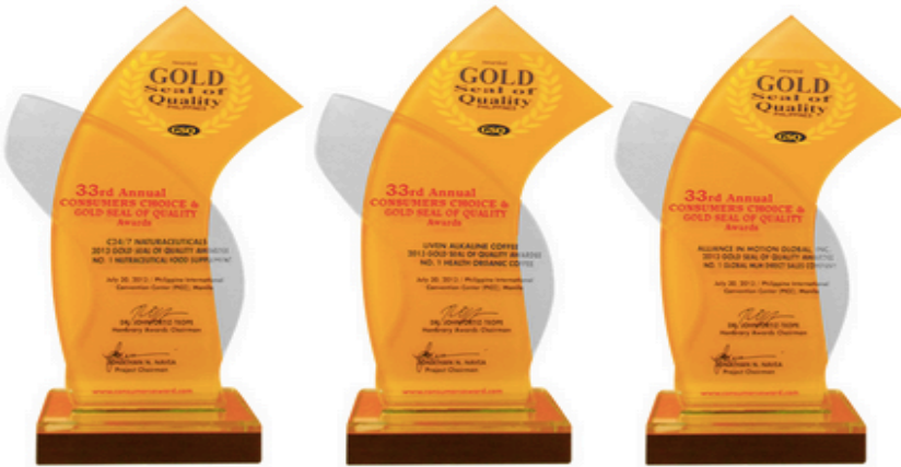
Consumers Choice & Gold Seal of Quality Awards No.1 Global MLM Direct Sales Company No.1 Nutraceutical Food Supplement No. 1 Healthy Coffee