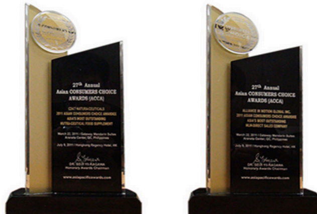
Asian Consumers Choice Awards Asia's Most Outstanding MLM-Direct Sales Company & Asia's Most Outstanding Nutraceutical Food Supplement