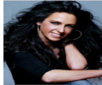
4. Younique - US