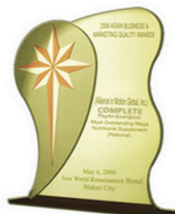
Asia Business & Marketing Quality Awards Most Outstanding Food Supplement