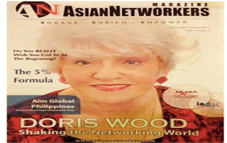
Recognized as the fastest growing MLM company in Asia by Asian Networkers Magazine