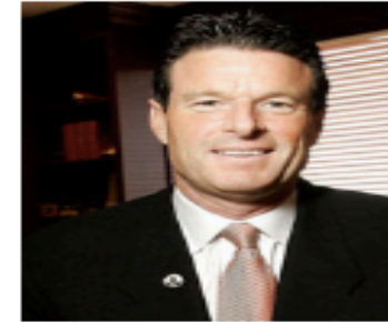
3. Herbalife - US