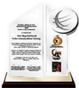
Global Awards for Marketing Excellence Most Outstanding Wellness Technology